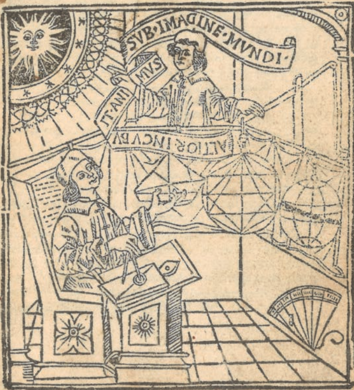
Figure 8. Bernat de Granollachs, Lunarium , 1513, title page motto: Altior incubuit animus sub imagine mundi ("The higher soul incubated under the image of the world").

Lunariū: in quo reperiunt Coniūctiones & Oppositiones Lunæ/ & Eclipses Solis & Lunæ/ per Anni circu- lum. Festa mobilia. Aureus numerus: & Littera dñicalis zē.