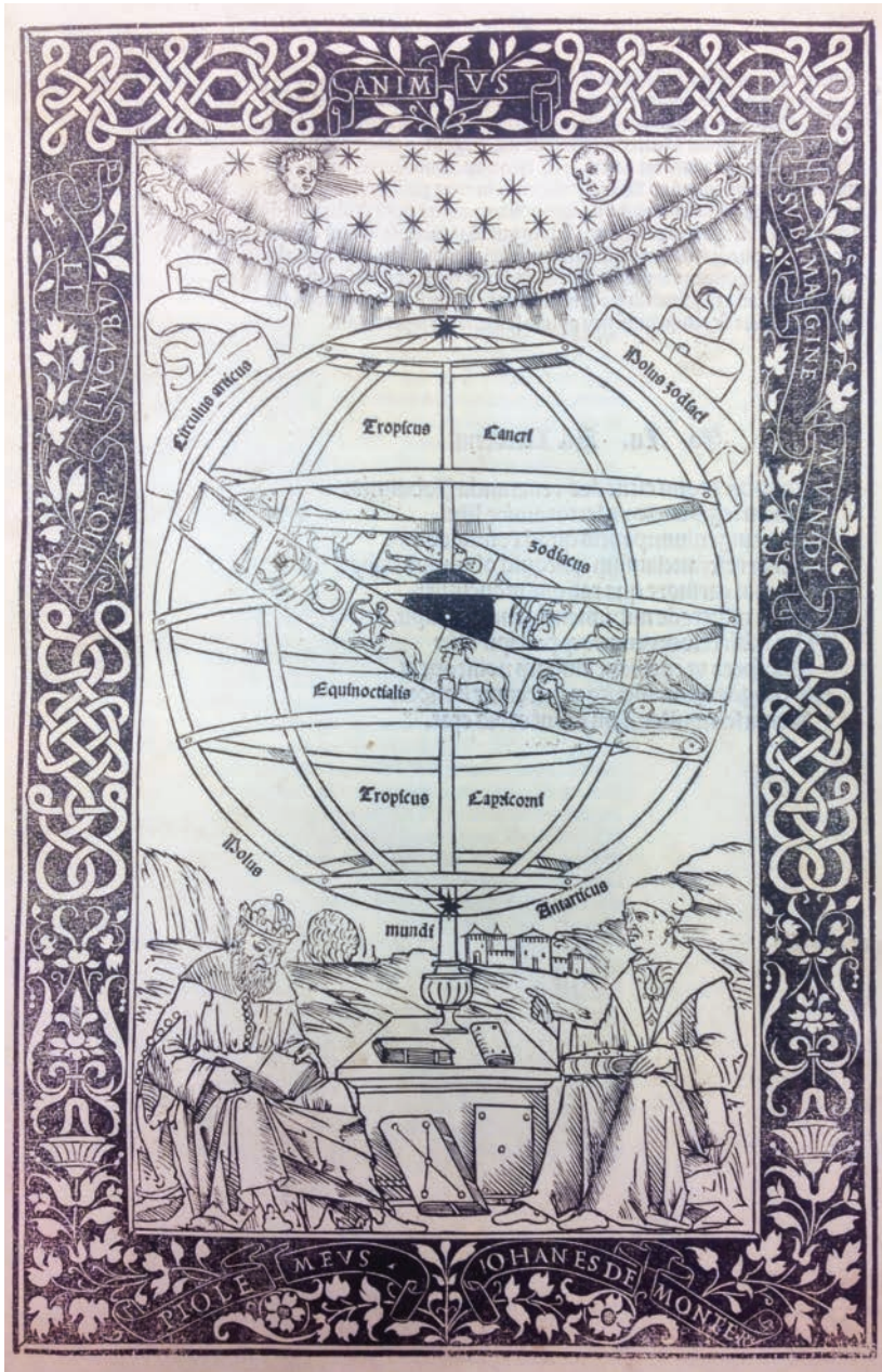
Figure 4. Regiomontanus, Epitome of the Almagest ( Epytoma in almagestum ), frontispiece illustration and motto: Altior incubuit animus sub imagine mundi ("The higher soul incubated under the image of the world")