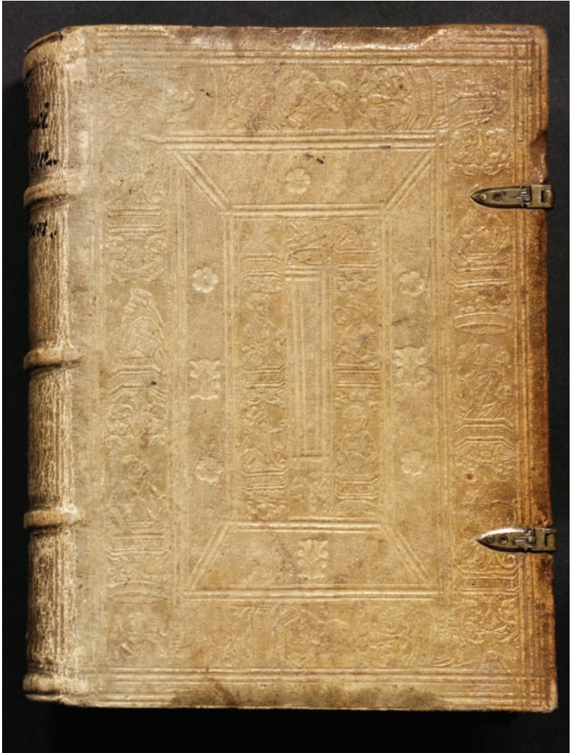
Figure 16. Rheticus-Schöner, bundled copy, binding, front cover