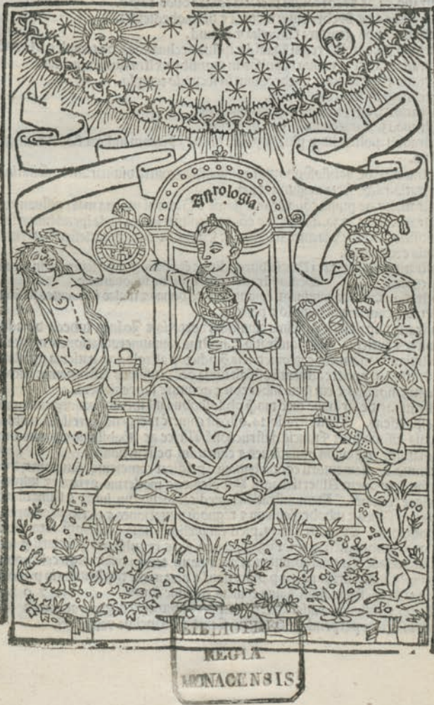
Figure 6. Astrologia on her throne, flanked by unidentified figures, 1494