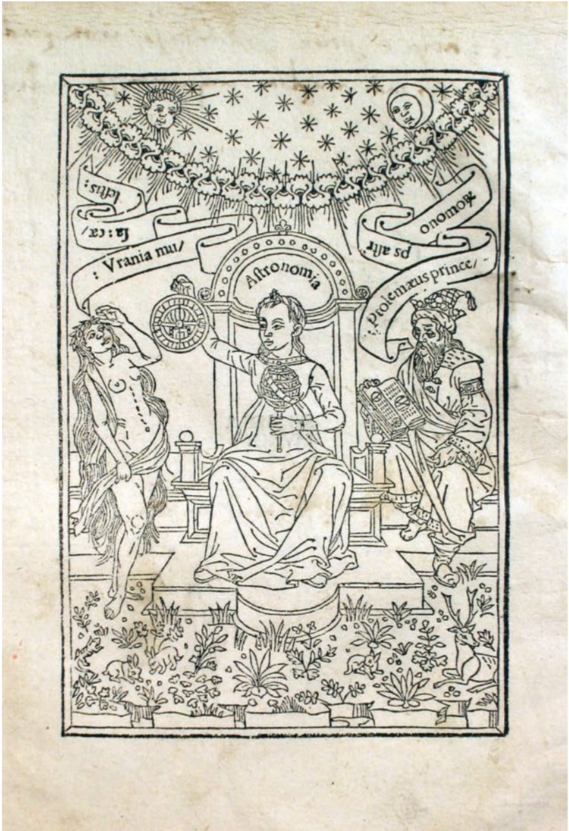
Figure 7. Astronomia on her throne, flanked by "Ptolemy, prince of astronomers" (right), and "Urania, the heavenly Muse" (left)