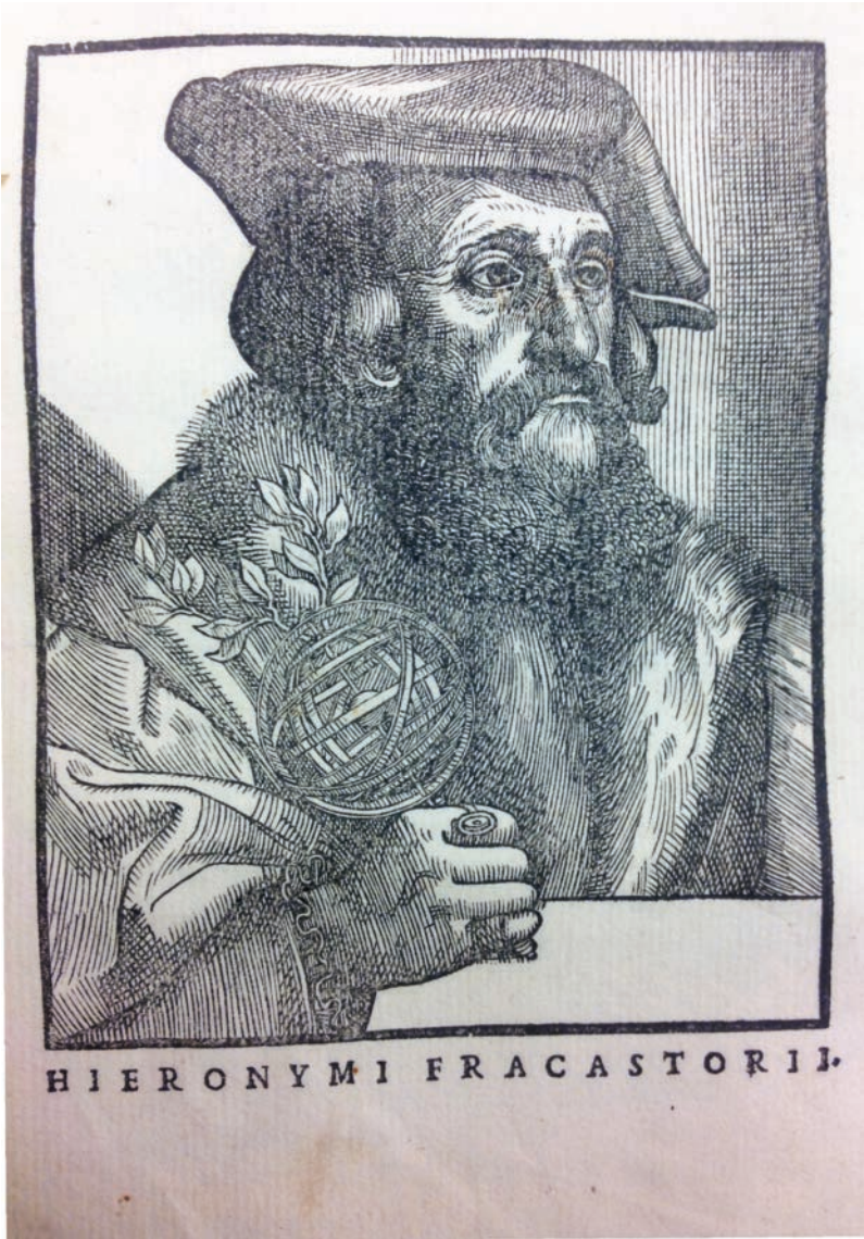
Figure 13. Portrait of Fracastoro from Homocentrica